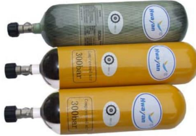
Figure 2 Cylinder

regulation of authority. The service time of steel cylinder is 12 years and the carbon fiber composite cylinder is 15 years.