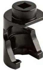
MODEL V36 RECESSED/CONCEALED (USED WITH MODELS V36 OR V39 SPRINKLERS)