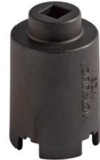
MODEL V29 CONCEALED