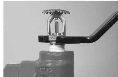
CORRECT ENGAGEMENT FOR MODEL V27 AND MODEL V34 OPEN-END WRENCH