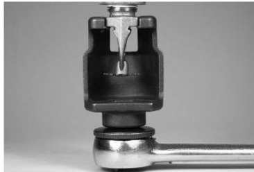
CORRECT ENGAGEMENT FOR MODEL V27-1 RECESSED WRENCH

Failure to follow these instructions could cause damage to sprinkler components, resulting in improper spray pattern, leakage, non-operation, and property damage.