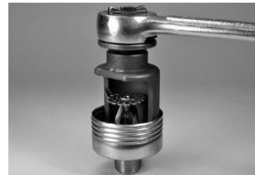
CORRECT ENGAGEMENT FOR MODEL V39 WRENCH ON V27 CONCEALED SPRINKLER