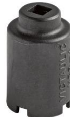
MODEL V38-4 SOCKET CONCEALED