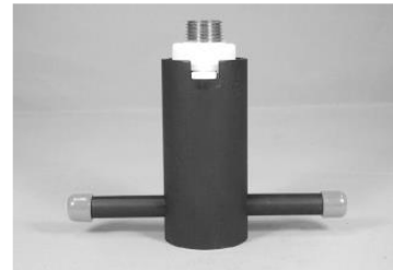
CORRECT ENGAGEMENT FOR MODEL V29 SOCKET WRENCH