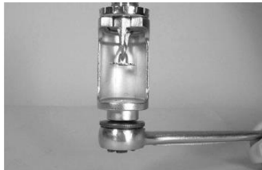
CORRECT ENGAGEMENT FOR MODEL V34 RECESSED WRENCH

Failure to follow these instructions could cause damage to sprinkler components, resulting in improper spray pattern, leakage, non-operation, and property damage.