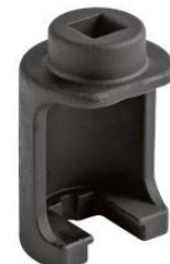
MODEL V39 CONCEALED