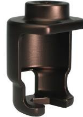
MODEL V27-2 RECESSED

In addition to standard offset open end wrenches, there is a socket for some sizes and open sided specialized wrenches for recessed or concealed installation.