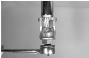
CORRECT ENGAGEMENT FOR MODEL V36 RECESSED WRENCH