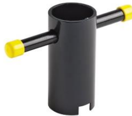
MODEL V38-5 OR MODEL V29-1 TEE HANDLE SOCKET