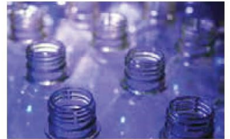
RECYCLING OF PLASTICS