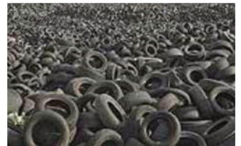
STORAGE OF TIRES